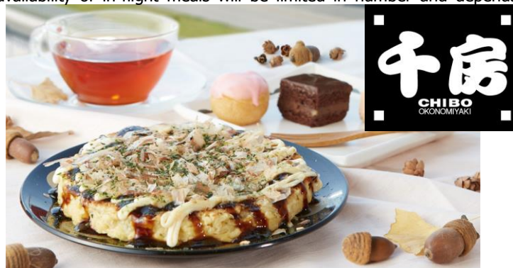
Okonomiyaki from Chibo

*Please note: The availability of in-flight meals will be limited in number and dependant upon route.