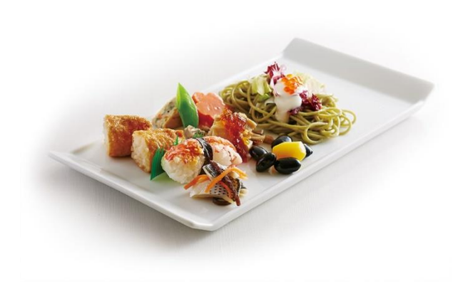
"Seasonal Bento (WINTER)"