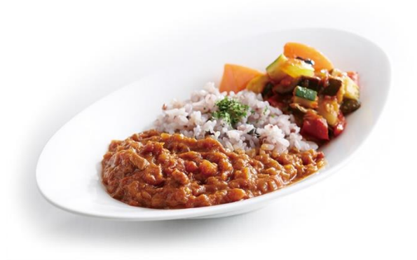
"Sixteen-Grain Rice and Qeema Curry with Chicken Breast"