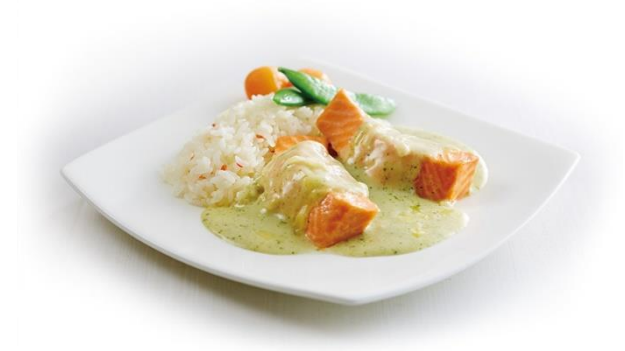
"Steamed Salmon Trout with Basil Cream Sauce"