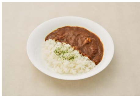
Japanese Curry Rice with Chunky Chicken JPY1,800