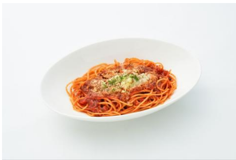
Rich Meat Sauce Spaghetti JPY1,800