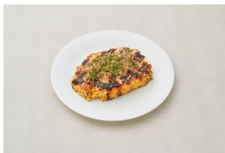
Chibo Pork Okonomiyaki (Pork) JPY1,500