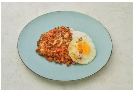
Thai-Style Basil Chicken with Rice JPY1,800