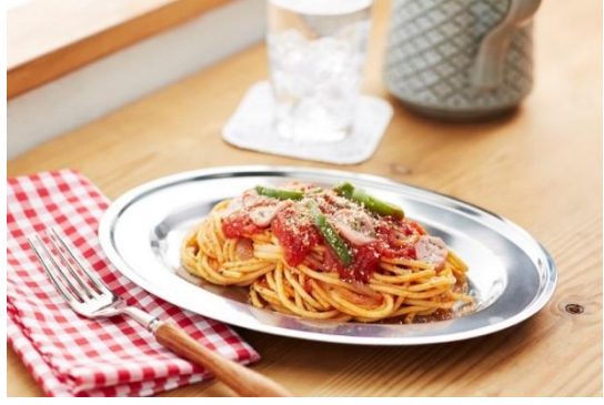
Napolitan Pasta: A Naples-inspired Japanese original pasta (600 yen)

In addition, to celebrate the merger of Peach and Vanilla Air, "PEACH DELI" will also launch sale of cotton candy from "Zarame", a popular cafe in the Arashiyama district of Kyoto. Original peach and vanilla flavors will be available exclusively on-board Peach flights. They are sold in easily-carried small packages that are perfect as souvenirs.