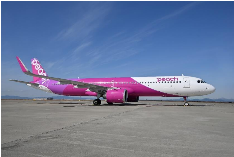
A321LR (Introduced from October 28, 2021)